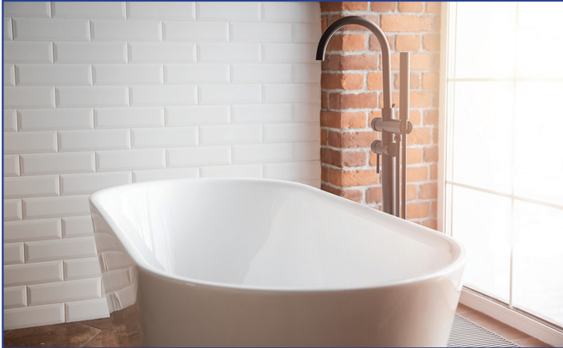
Most brands require floor or wall mount faucets.