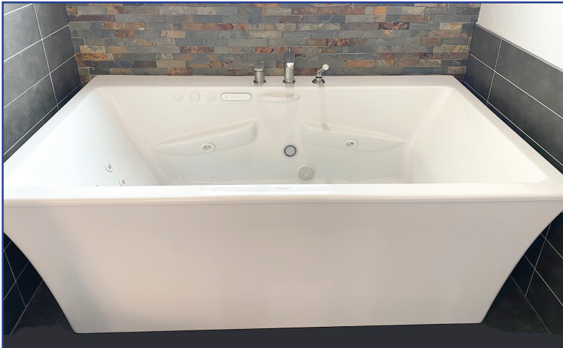
Hydro Massage offers deck mount faucets for more choice.

Most competitors require you to buy a floor or wall mounted faucet for their freestanding bathtubs. With a Hydro Massage bath, you can choose a floor mount, wall mount, or a deck mount faucet. We offer a deck mount faucet location because it can save you $500-$2,000 over the other options. In addition, deck mounted faucets normally deliver a higher gallon-per-minute flow of water, filling your bath quicker. Who wants to sit around forever waiting for their tub to fill up? We recommend a flow rate of 12-18 gallons a minute.