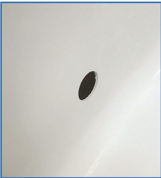
Sidewall sample hole for structural strength and stability.

Most companies try to cut costs on the quality and the thickness of the acrylic sheet, and also on the amount and thickness of fiberglass reinforcement. When they use a 20% thinner sheet of acrylic and 200-300% less fiberglass, the savings are considerable for them, but the customer is the one who suffers. Some baths may feel like you are sitting in an eggshell with flimsy sidewalls and floors that flex and squeak when stepping in or sitting down. When bathtubs are inferior with poor quality, the possibility of cracking and failure goes way up. This is precisely why some companies offer such short warranties.