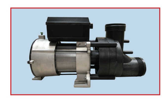
Smaller, cheaper low-performance pump are used by most companies.

"What was really important to me was a very powerful therapy system. It is probably the most powerful jet tub that I've ever been in!!"