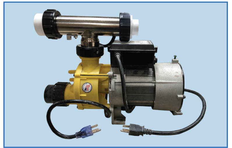
Made in America Super Flo 3.25 HP 3-speed pump with stainless steel heater has up to 80% more power and performance for the best massage on the market.