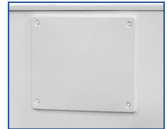
Equipment Access Panel